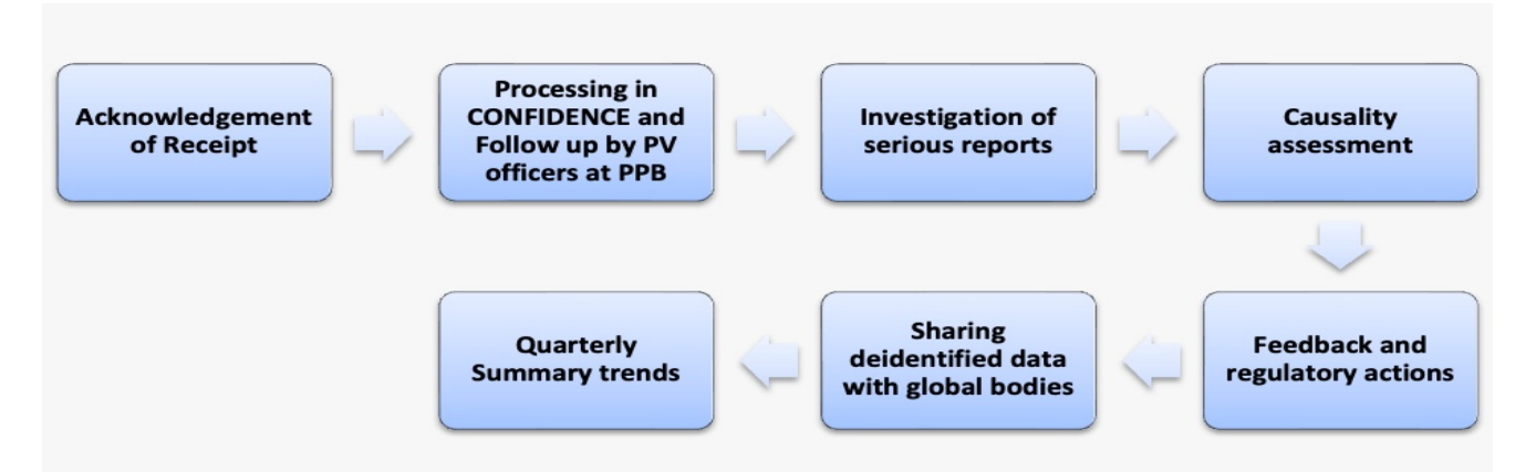
Figure 1: What happens to the reported adverse events