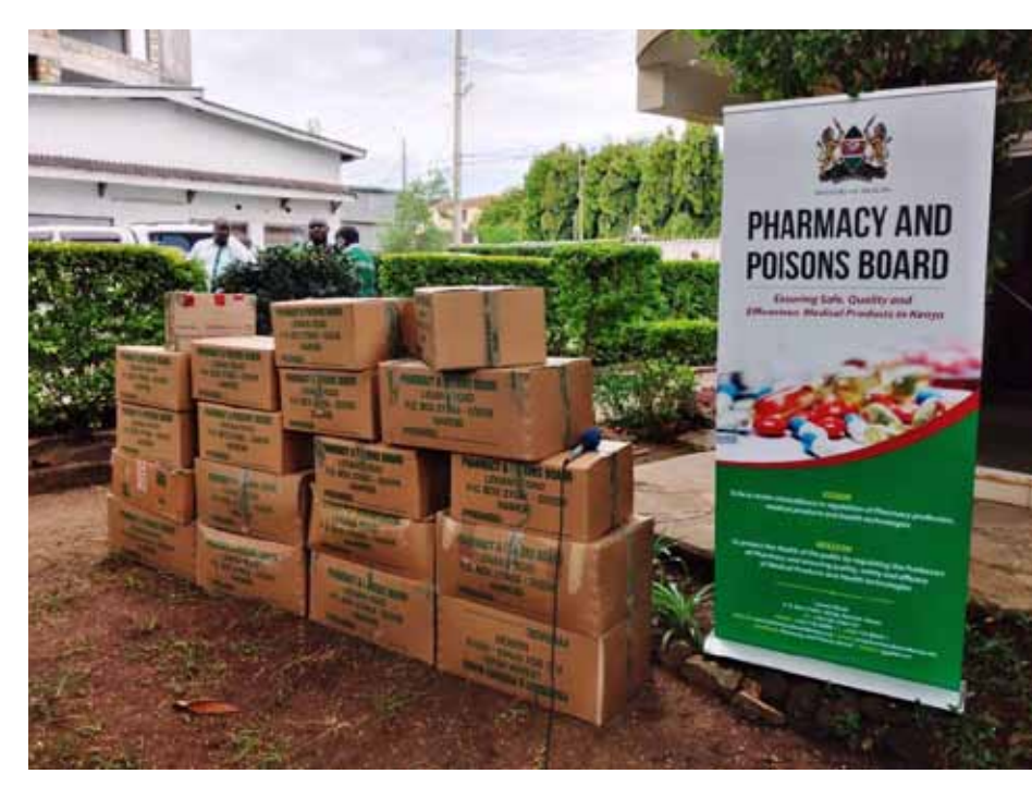
Some of the drugs confiscated by the Pharmacy and Poisons board during a crackdown in coast region

He called on members of the public to use health safety codes displayed in registered pharmacy outlets to verify legality of the premises they get medicines from by sending a message to the 21031 charge free code.