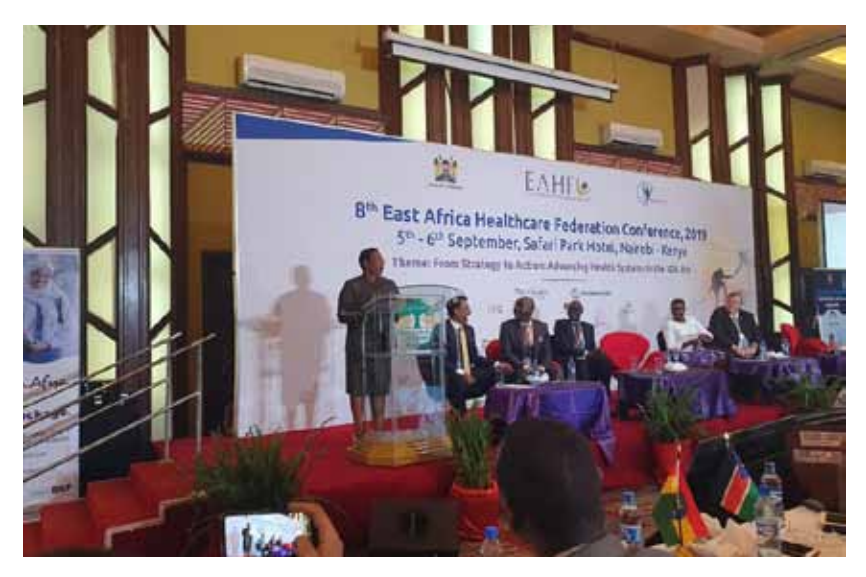
Health Cabinet Secretary Sicily Kariuki addresses participants at the 8th East Africa Healthcare Federation (EAHF) Conference

n September 5, 2019 the Health Cabinet Secretary Sicily Kariuki officiated the opening of the 8th East Africa Healthcare Federation (EAHF) Conference under the theme "From Strategy to Action: Advancing Healthcare Systems in the SDG era."