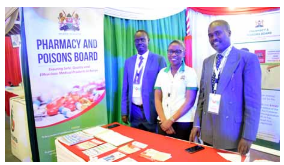
PPB staff pose for a photo during the 5th Annual Tax Summit at KICC

PB exhibited at The Kenya Revenue Authority - 5th Annual Tax Summit that took place at KICC between 16th & 17th October, 2019 in recognition of the collaboration towards enhancing trade facilitation in the country and combating illicit trade. The theme of the event was "Tax Simplification and Inclusivity to Facilitate Trade and Economic Transformation."