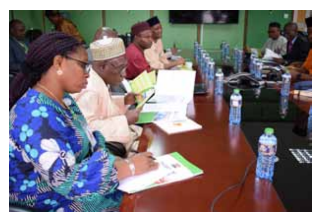
High-Level Government officials from the Federal Republic of Nigeria at PPB for a study tour

The officials drawn from a wide range of state ministries, departments and agencies visited PPB to familiarize with the role the Board plays in realization of UHC in Kenya and its linkages with other agencies like the Kenya Medical Supplies Authority among others.