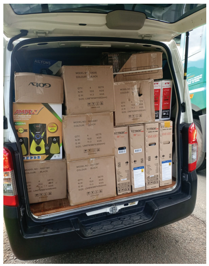
Inside a van transporting medicines illegally.

The Pharmacy and Poisons Board inspectors in conjunction with Kenya Police Service on 29th October 2021 carried out a targeted crackdown on illegal drug distribution outlets within Nakuru, Kericho, Bomet, Samburu, Narok and Laikipia counties.