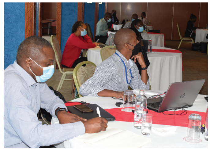
Partcipants follow proceedings at the PV/PMS and TWG meeting.

The National Pharmacovigilance and Post marketing surveillance technical working group on 1st November 2021 held a consultative meeting aimed at strengthening PV/PMS systems in Kenya.