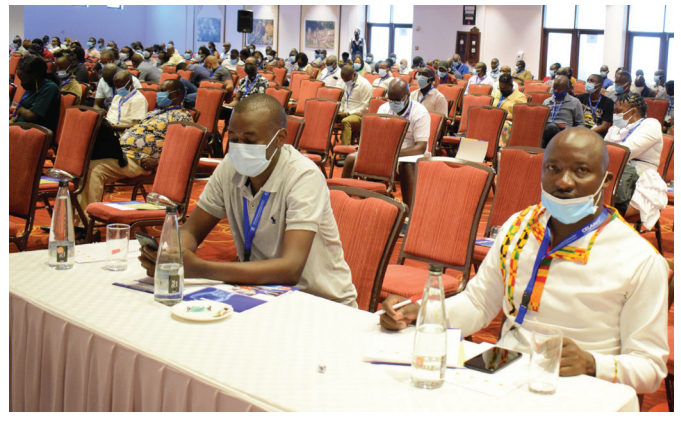
Conference participants follow proceedings at the 17th KPA Annual Scientific Conference.

On September 16, 2021 PPB exhibited at the 17th Annual Scientific Conference for the Kenya Pharmaceutical Association in Pride Inn Shanzu, Mombasa.