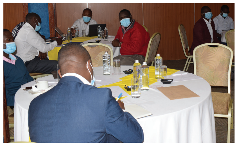
Participants at the AMR workshop in Nairobi's Panafric Hotel.

The workshop also focused on the role of National Medicines Regulatory Authority (NMRAs) in combating AMR as well as defining the next steps in areas of impact from a regulatory perspective.