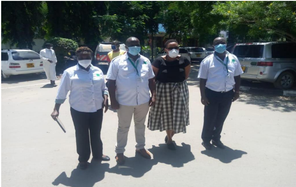
Figure 3: Post-market surveillance team visiting the Coast General Provincial Hospital for market surveillance of Personal Protective Equipment