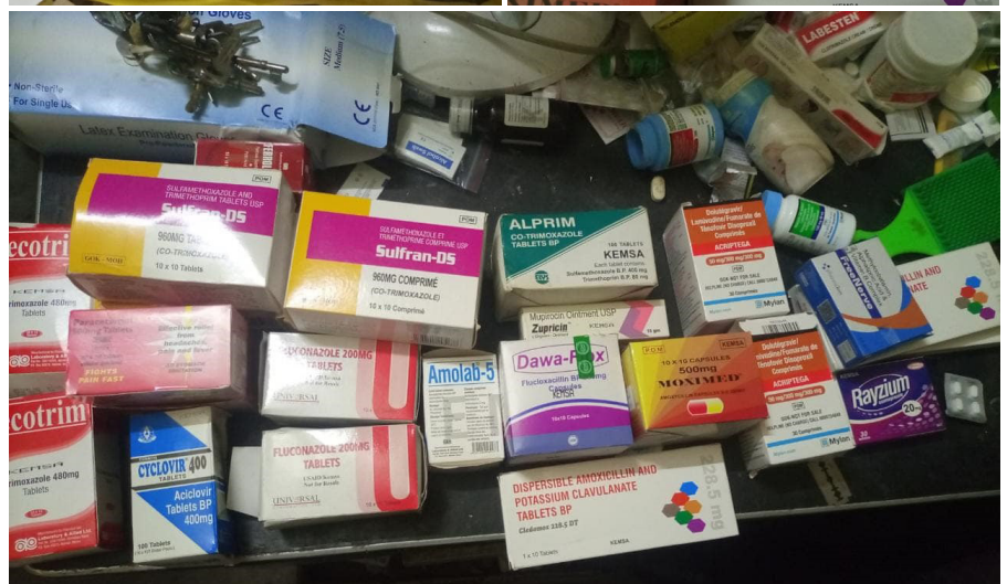
Seized pharmaceuticals during a raid at a pharmacy in Mtwapa