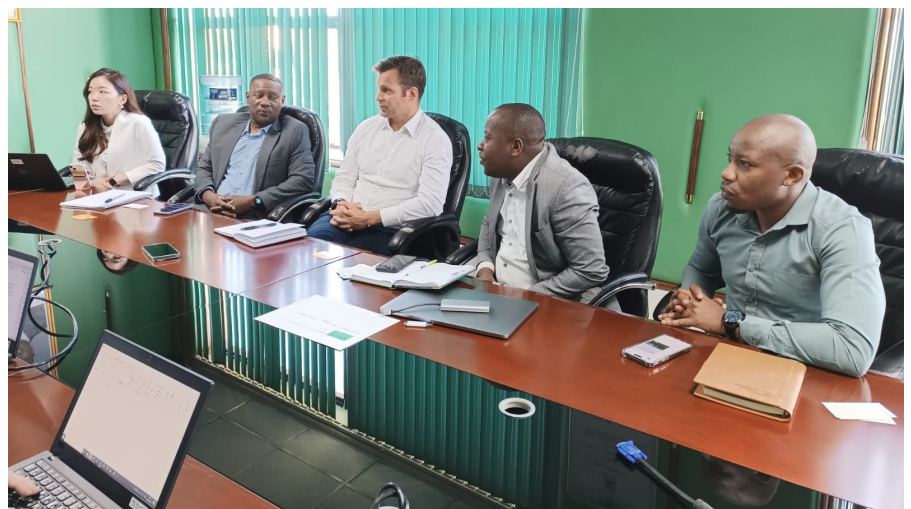
Delegates at a meeting in Pharmacy and Poisons Board

Discussions focused on the pharmaceutical registration process at PPB. With the support of IFC-World Bank, the Kenyan