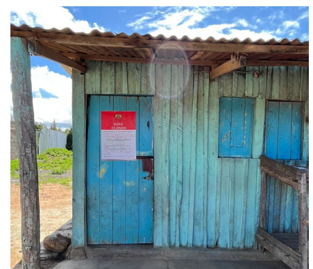
A closed illegal premise