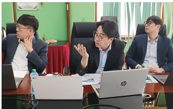
The Korea Economic Development Cooperation Fund team during the meeting

The visit marks a significant step towards the realization of the vaccine manufacturing facility in Kenya, which is expected to enhance the country’s healthcare capacity and provide better access to vaccines for the population.