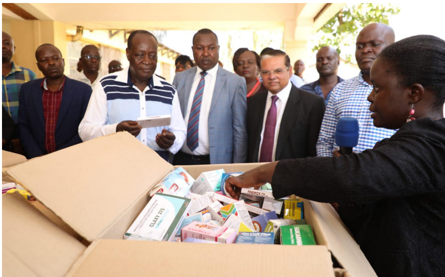
Assorted medicines donated to Vihiga County