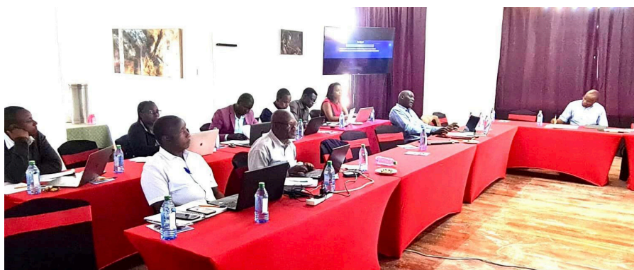
Stakeholders follow proceedings at a workshop to develop guidelines for sales representatives

trained and qualified to conduct their tasks effectively and that they comply with the legal and ethical standards of the pharmaceutical industry. “This will enhance consumer confidence and ensure that the public receives accurate and reliable information about medicines and other medical products,” he noted.