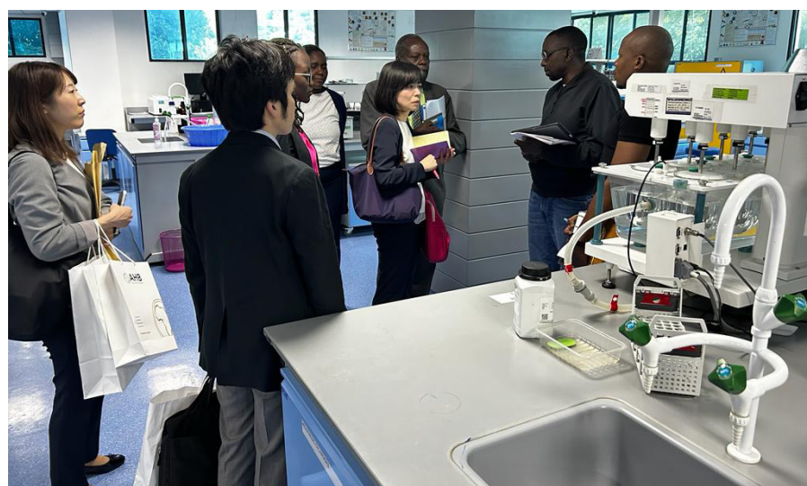
A tour of the PPB Quality Control Laboratory

The Pharmacy and Poisons Board on February 6, 2023 welcomed a delegation from Japan International Corporation Agency (JICA), Deloitte Japan, and Africa Health Business (AHB) to discuss gaps and opportunities in clinical trials and drug manufacturing in Kenya. Collaboration was a key theme of the meeting as the organizations explored ways to support the Kenyan vaccine and pharmaceutical sector. Let's work together to advance healthcare in Kenya.