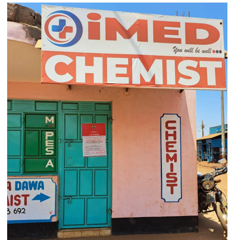
A closed chemist in Upper Eastern region

To help the public identify illegal pharmaceutical premises, the Board advises verifying the registration details of pharmacy practitioners at community pharmacies, hospital pharmacies, and other drug dispensing facilities. Anyone suspecting