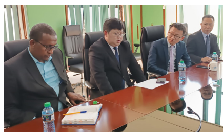
Representative from Chongqing Zhifei Biologicals during the meeting