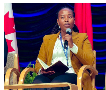
Pharmacy and Poisons Board Head of Medical Devices makes her remarks during the meeting.

By joining a network of regulators including the U.S. Food and Drug Administration, UK-Medicines & Healthcare Products Regulatory Agency (MHRA), Health Canada,