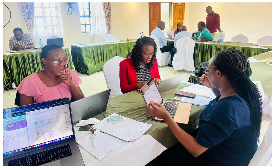
Workshop Participants during group sessions.