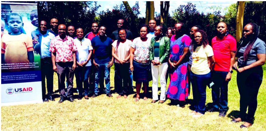
Participants pose for a photo after the workshop.

Development Plans (IDPs) related to market surveillance & control and regulatory system (RS) functions. PPB expresses gratitude for the continued support offered by USAIDKenya and PMlgov towards strengthening medicines regulatory systems in Kenya.