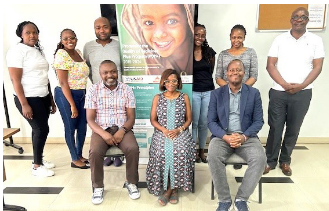
A group photo of the workshop participants.