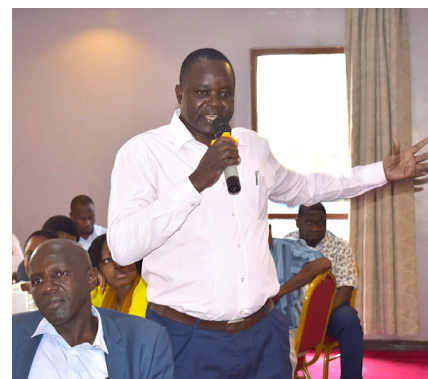
A participant shares his views during the workshop.

Pharmaceutical Quality Systems, encompassing complaints, recalls, deviations, incidents, change control, and handling out-of-specifications. The initiative's goal is to enhance knowledge and elevate pharmaceutical manufacturing standards in Kenya.