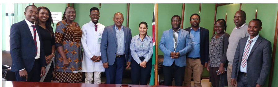
Pharmacy and Poisons Board EDC, KPA & PSK officials pose for a photo after the meeting

On January 31, 2024, the Enquiries and Disciplinary Committee (EDC)