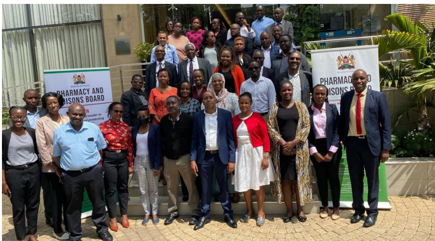
Participants pose for a photo after the workshop.

In a pivotal move towards advancing clinical research, the Pharmacy and Poisons Board's Clinical Trials Division organized a consultative forum from January 22nd to 26th, 2024.