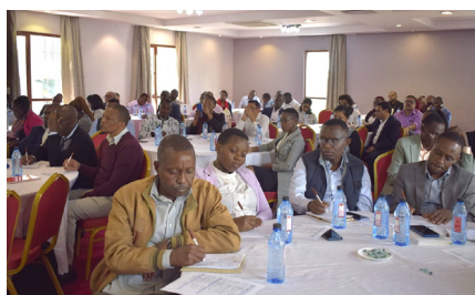
Workshop participants follow the proceedings.

From January 22nd to 24th, 2024, the Pharmacy and Poisons Board (PPB) organized a three-day workshop for local Health Products and Technologies (HPTs) manufacturers.