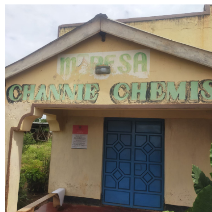
Closure notices displayed on closed pharmaceutical outlets during the crackdowns.

pharmaceuticals are advised to apply online for the disposal of pharmaceutical waste or contact PPB regional officers for assistance.