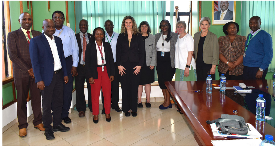
A group photo after the meeting.

particularly in the automation of its processes, which facilitates a seamless approach to submissions.